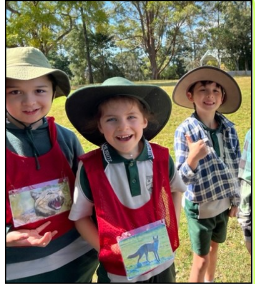
Photos: Dorroughby Incursion 1/2L