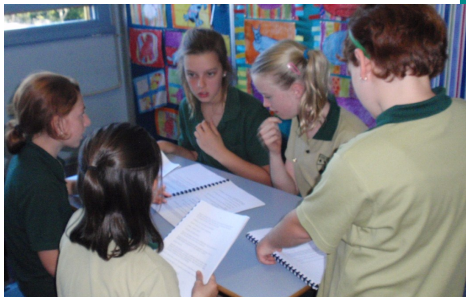
Students rehearsing for Robin Hood

These awards will be presented at Mondays assembly at 2.40pm. Parents are always welcome to attend.