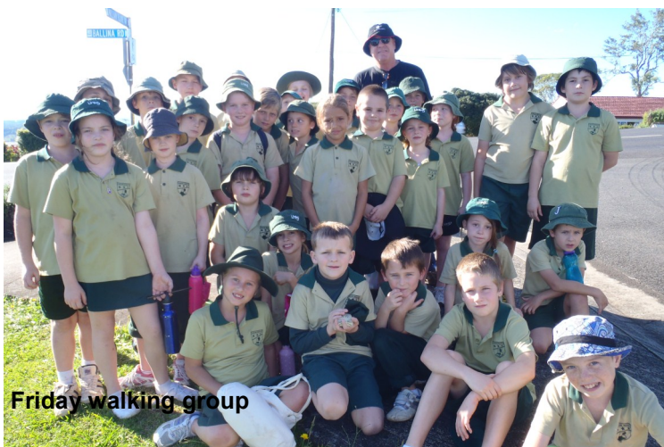
Friday walking group