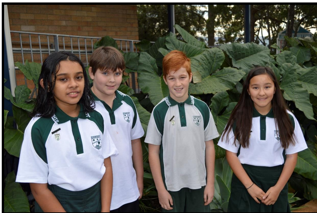
Above: Lismore Heights Public School Captains and Vice Captains 2021